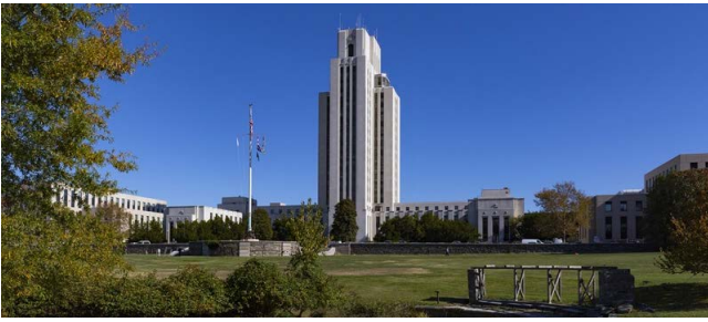
Walter Reed National Military Medical Center, Bethesda, Maryland