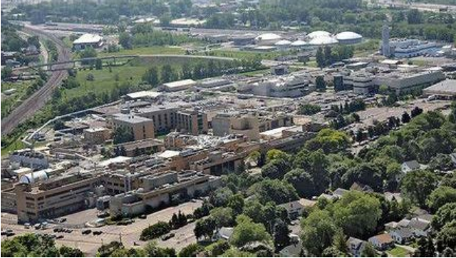
A 2010 image of the penicillin plant at Bristol-Myers Squibb in East Syracuse, New York

Around 80% of active pharmaceutical ingredients (APIs) used to make generic drugs are now sourced from overseas, and the vast majority of those APIs now come from China. Starting about 20 years ago, extraordinarily low prices for APIs were made possible by cheaper labor, lack of pollution regulations, and other factors unique to China. As a consequence, many U.S. companies found it impossible to compete with the prices for Chinese suppliers' ingredients and closed, sold, or repurposed their facilities. The last U.S. penicillin plant closed in 2004.